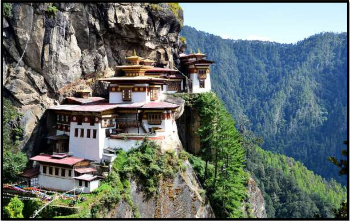
Taktsang (Tiger's Nest) Monastery